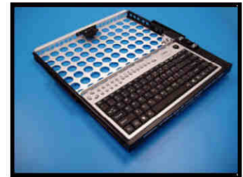
Optional Under Desk Mount Retractable Keyboard/Trackball Assembly Supports 2 Consoles Part # DTD-KBM-101A