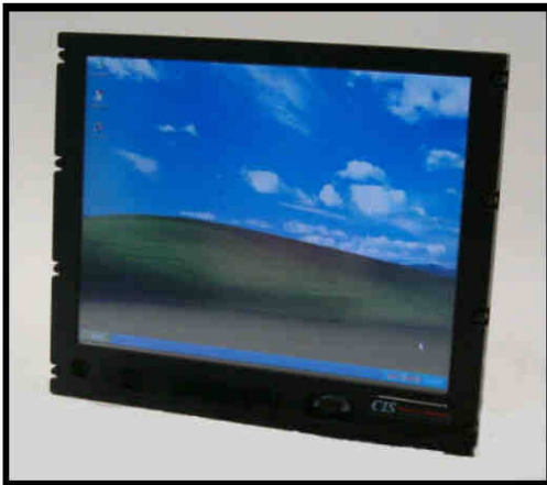
15" Color Touch Screen